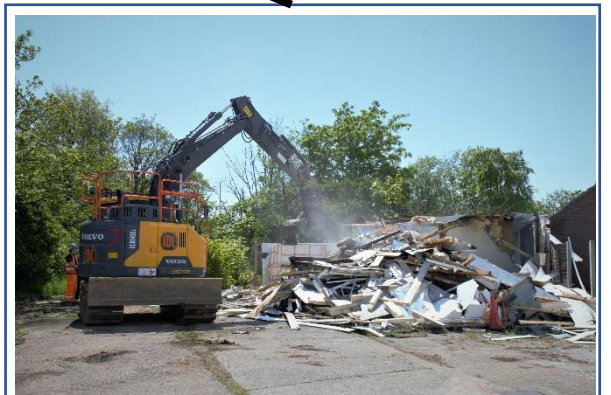
Durban Road Area Demolition