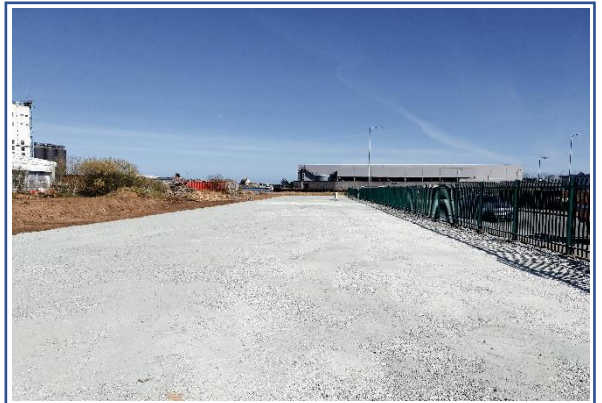
Lings Car Park