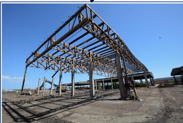
Jeld Wen Shed Demolition