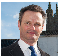
Peter Aldous Member of Parliament for Waveney

"Lowestoft residents have been waiting a lifetime to see the bridge become a reality, and in just a few years I hope they will be able to walk across it, we are working towards opening the bridge in the summer of 2023."